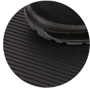
G1302 Rectangular Ribbed Mat black