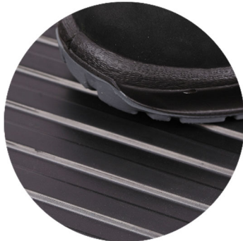
G1303 Wide Ribbed Mat black