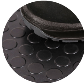
G1304 Round Button Mat black