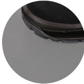
G1301 Fine Ribbed Mat grey